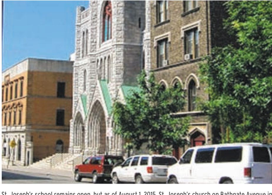
St. Joseph's school remains open, but as of August 1, 2015, St. Joseph's church on Bathgate Avenue in Tremont was closed, and the parish is merged with St. Simon Stock.