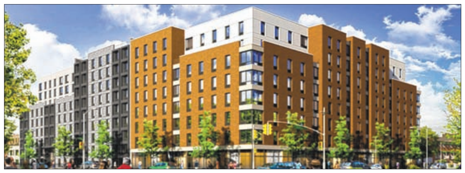
Rendering of 1755 Watson Avenue, for which permits have been filed for a 312,880-square-foot mixed-use building in Soundview.

The building will have three elevators, a courtyard, laundry room, fitness center, media room,