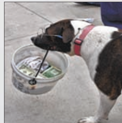
A four-legged friend helped collect money for the worthy cause.