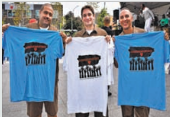
UPS took time to donate lifesaving items to affected Puerto Rican families and residents.