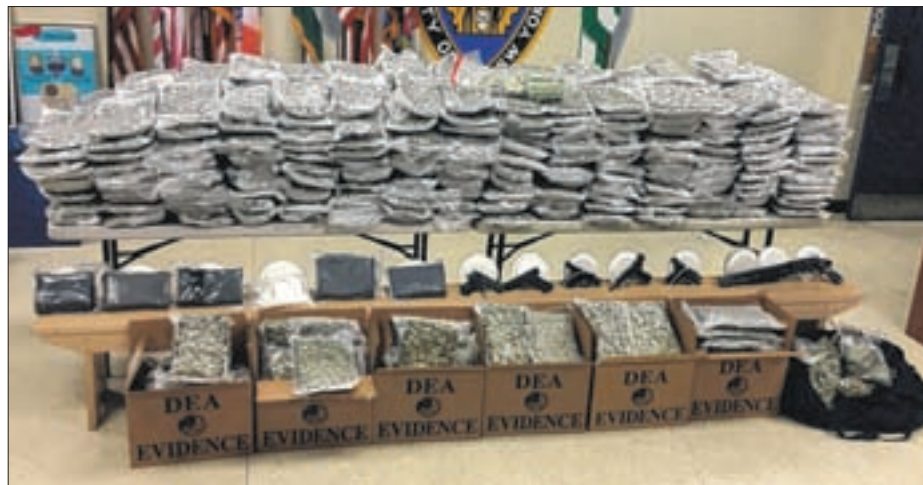
Shown are firearms and drugs found at the Stephens Avenue and Fox Street residences in the Bronx, along with other guns and narcotics obtained with search warrants at other addresses in the Bronx.

Courtesy of US Attorney of the southern district of NY.